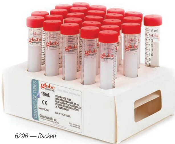
6296 — Racked